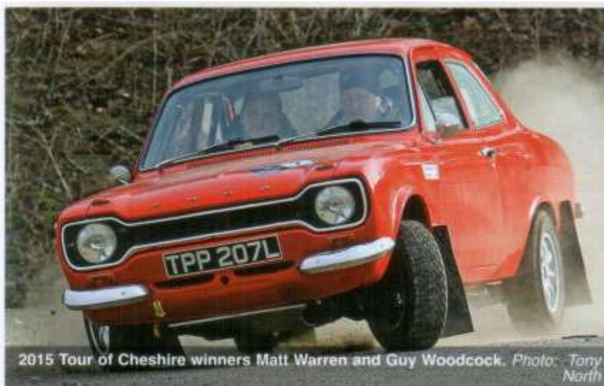
2015 Tour of Cheshire winners Matt Warren and Guy Woodcock.